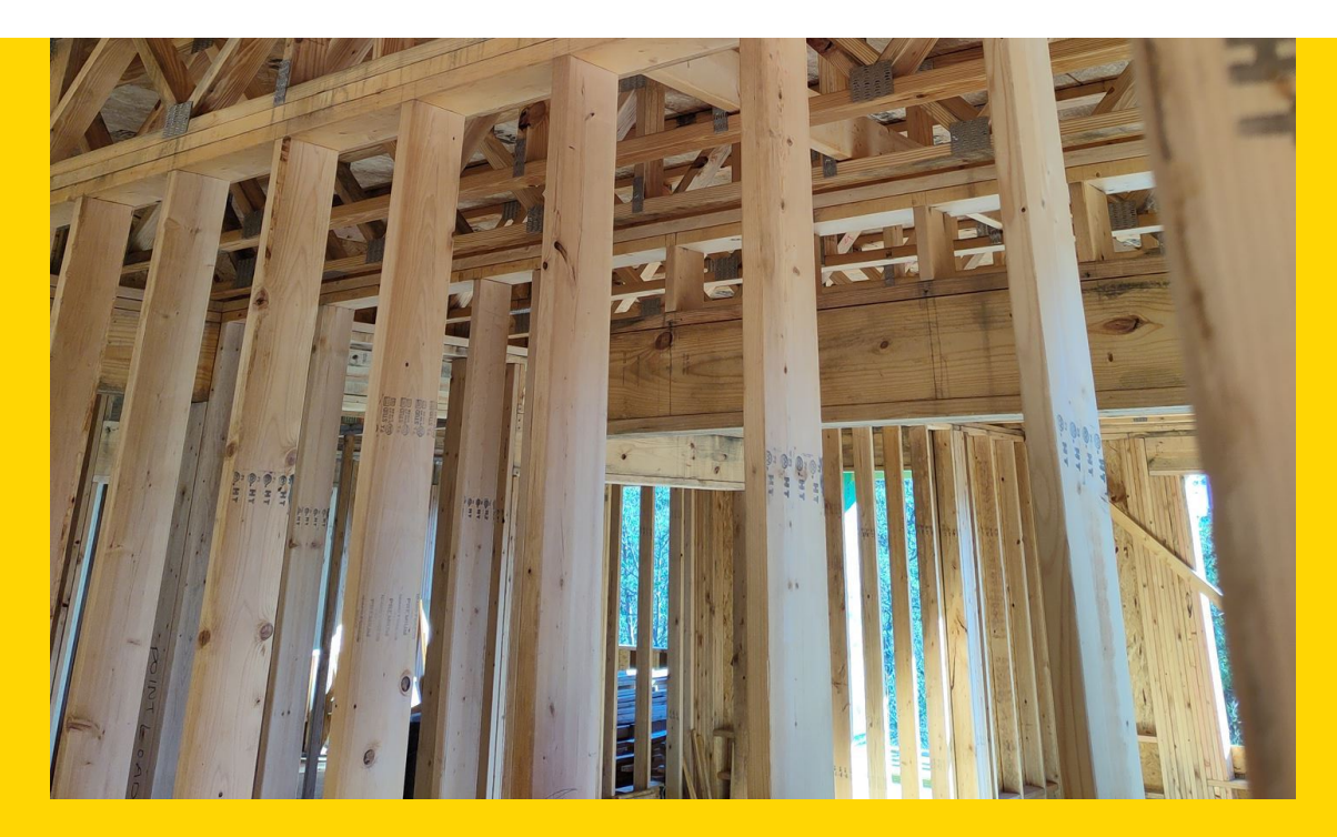
Interior photo of Prout Research Institute under construction